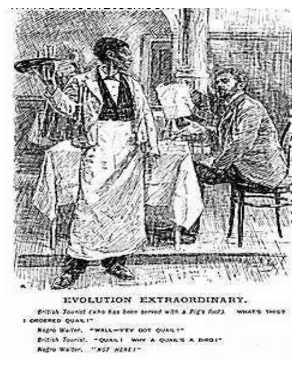
Figure 2. ("Punch")