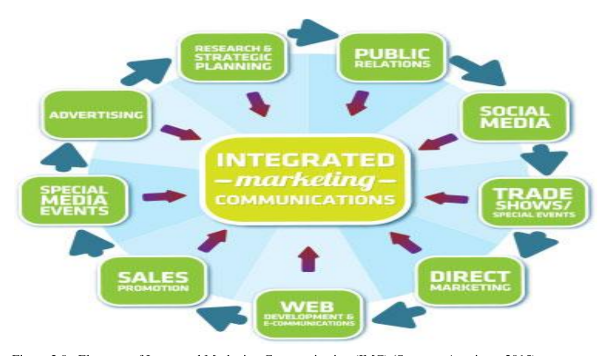
Figure 2.0: Elements of Integrated Marketing Communication (IMC) (Sources: Anzeigen, 2015).

and communication resource especially toward the potential of customer engagement (Noone et al., 2011).